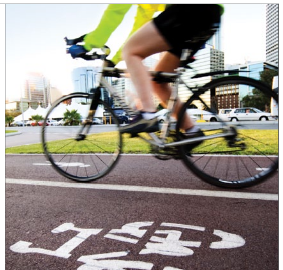
Several NEEA employees commute by bike

For occasions when mass transit would be used, Lloyd also factored in how far the employee would need to drive to the bus stop or rail station, if at all. It was assumed that any potential site, no matter the submarket, would be within three or four blocks from mass transit lines. Sites without public transportation would have such a high carbon footprint in terms of employees’ commutes that they weren’t even an option for us.